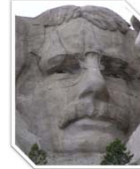
Roosevelt's face on Mount Rushmore